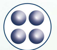
Capsule with active ingredients

Hydrating, anti-inflammatory and anti-irritant